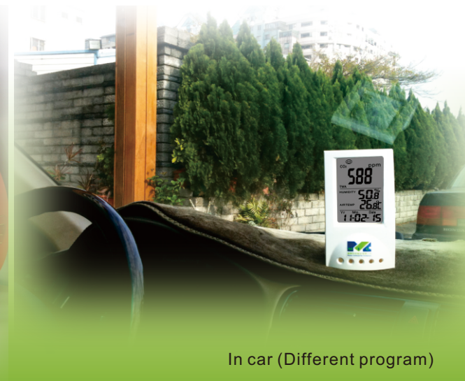
In car (Different program)