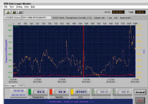
98130D software main screen