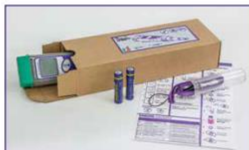
Tester kit Ecopack