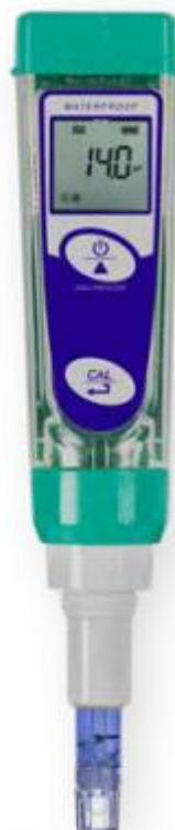
Tester PH2620/PH 1