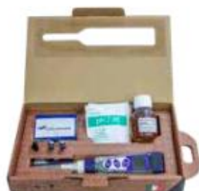
Kit EC2630/COND 5