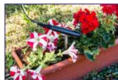
Soil conductivity with VPT Soil