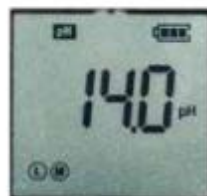
Display PH2620/PH 1