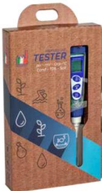
EP2000/PC 5 kit cardboard case