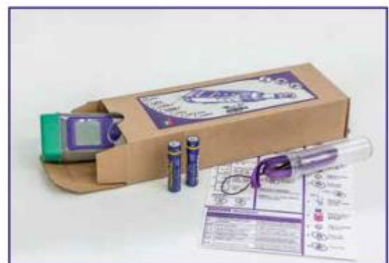
Tester kit Ecopack