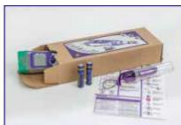
EC2630/COND 5 Ecopack