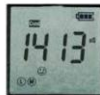
Display EC2620/COND 1