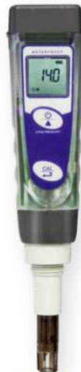
Tester EC2620/COND 1