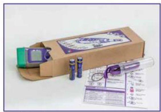
Tester kit Ecopack