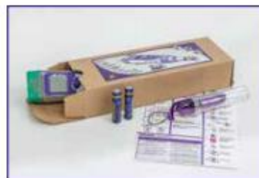
EC2630/COND 5 Ecopack