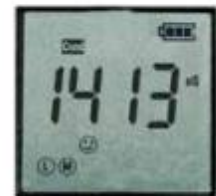
Display EC2620/COND 1