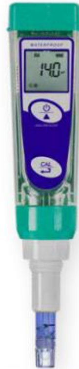
Tester PH2620/PH 1