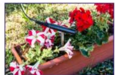
Soil conductivity with VPT Soil