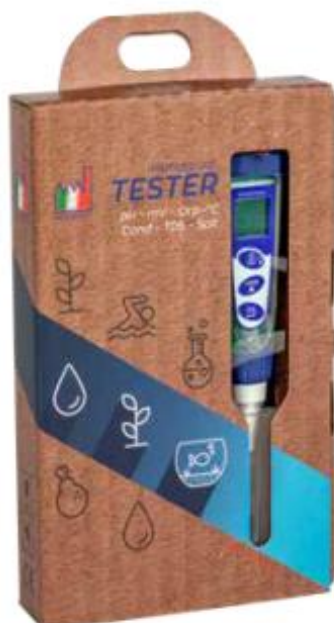
EP2000/PC 5 kit cardboard case