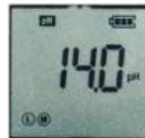
Display PH2620/PH 1