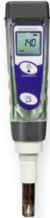
Tester EC2620/COND 1